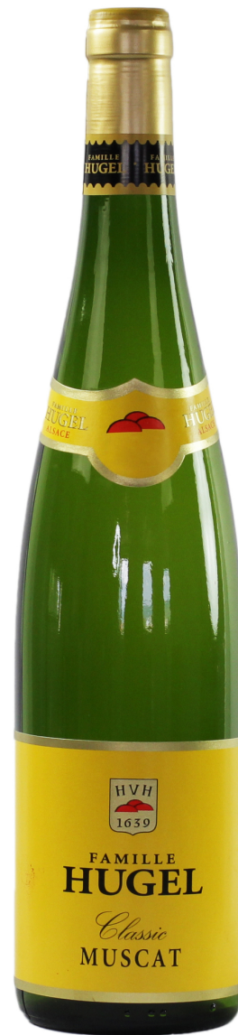
Muscat Classic 2014