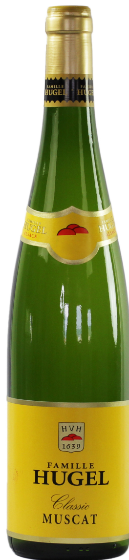
Muscat Classic 2013