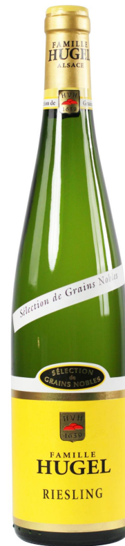
Riesling SGN 2010